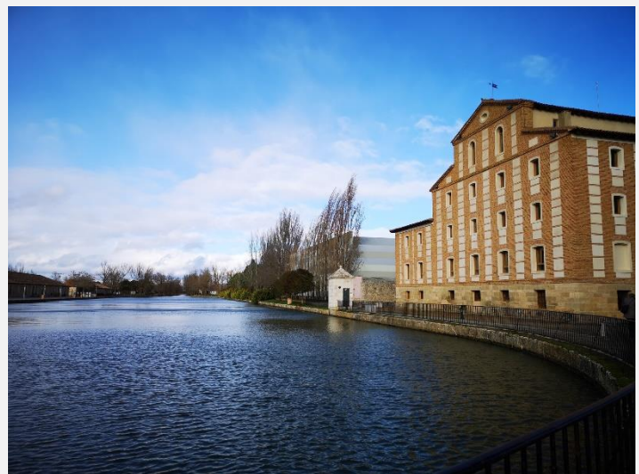
Dock of the Canal of Castile, Medina de Rioseco, Spain

Promoting social and cultural sustainability: by empowering local entrepreneurs and artisans, we celebrate the cultural heritage of watercourse regions,