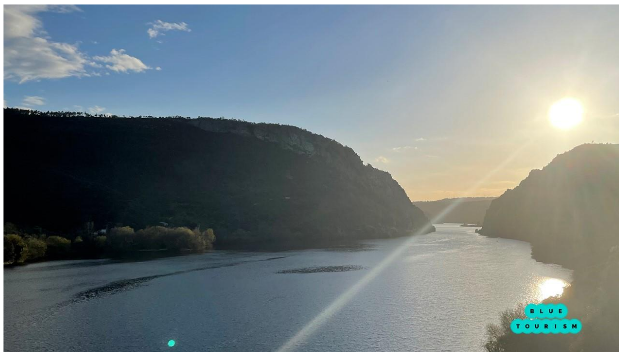
Portas de Ródão, Vila Velha de Rodão, Portugal

The BLUE TOURISM, is an Erasmus+ project, aiming at building a network of local advisors to put small tourism providers in watercourse regions on a more sustainable path. In this context, Water, as renewable resource is the common link between the six countries – Portugal, Cyprus, Spain, Slovenia, Romania and Ireland – that integrate the project consortium.